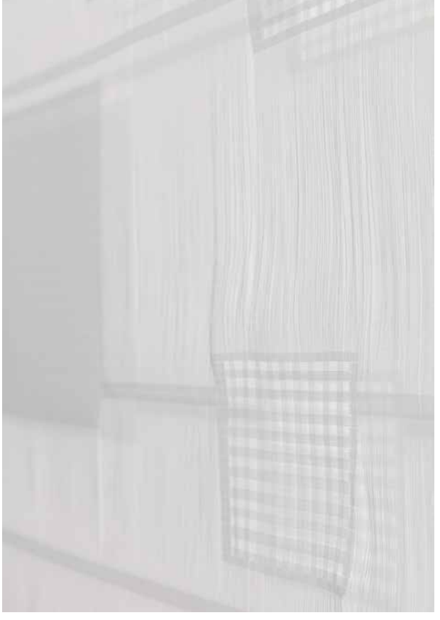
Marina Weffort. Untitled [Grey mapa mundi], 2021. Detail. Fabric and pins 35 % x 51 % x 1 % in.