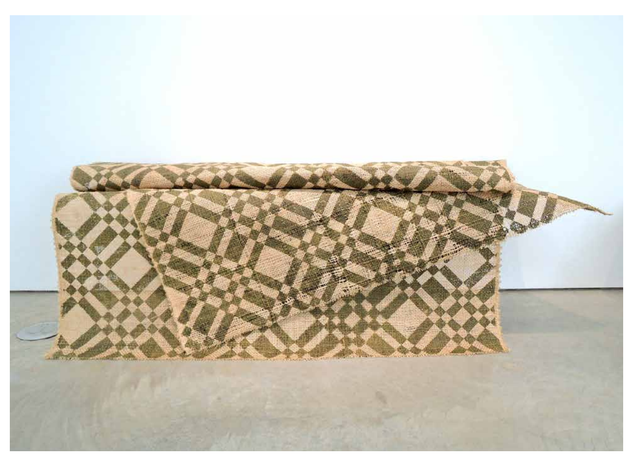
\label{limited} \textbf{Miguel Angel Rojas.} \ \textit{Sin frio permanente} \ (\mbox{Without a constant chill}), 2012 \\ \mbox{Impression with coca leaf powder on jute.} \ 96~\%~x~56~\%~in