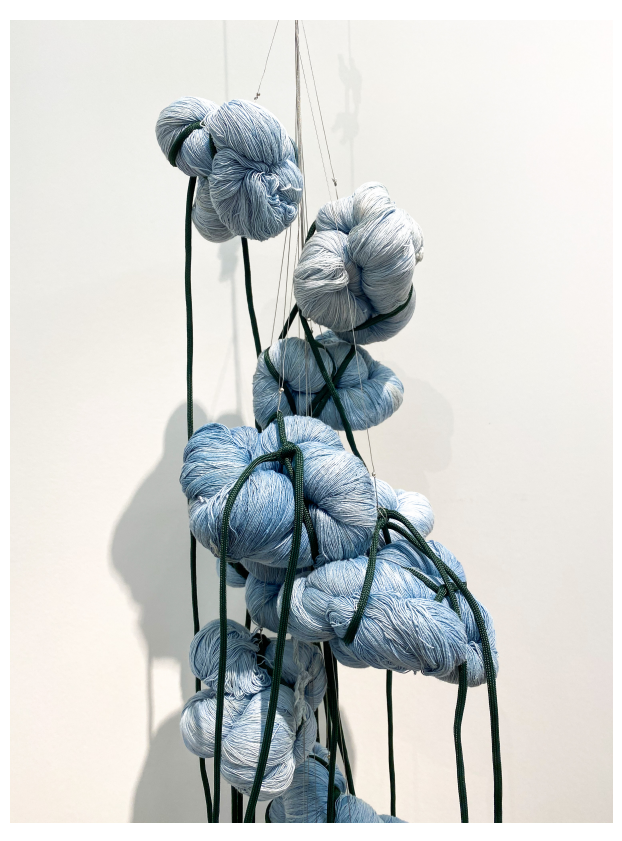
Sandra Monterroso. Puntos en resistencia azul, Edition. 7/13, 2019. Setail. Installation Indigo dyed yarn, loop, steel rope, 13 knots 58\times10\times7 in.