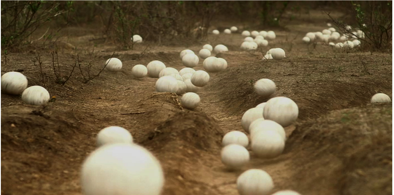
Piedras Blancas, 2014, video still.