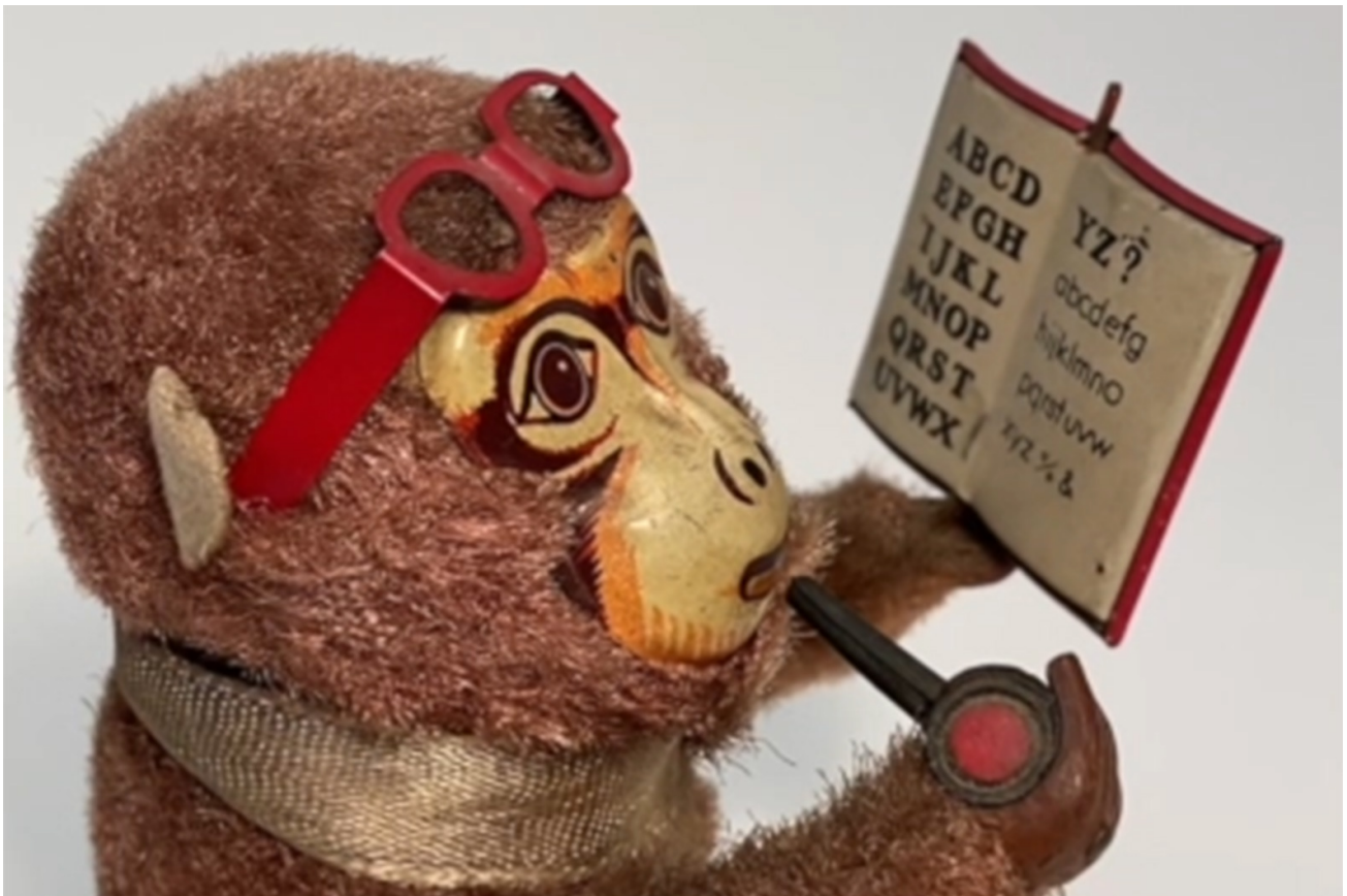
One of the characteristic figurines of Porter's works, included in the video