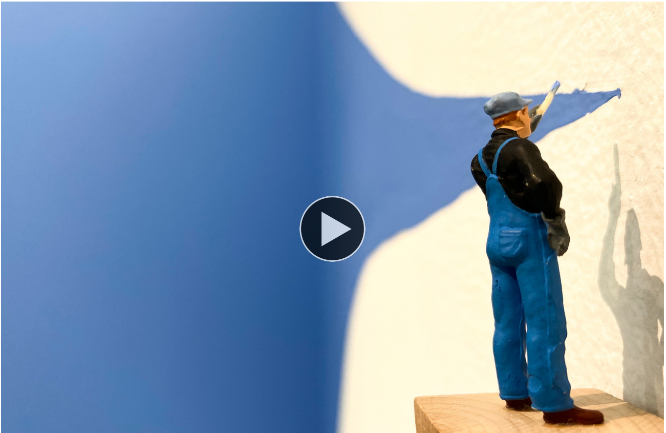
A video walkthrough of Liliana Porter's 2020 exhibition, Red Brush and Other Situations , currently on view at Sicardi | Ayers | Bacino gallery