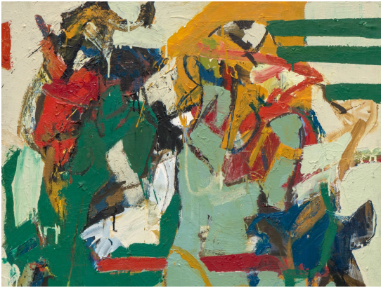
Wook-kyung Choi, Untitled, 1960s Acrylic on canvas, 101 x 86 cm © Wook-kyung Choi Estate and courtesy to Arte Collectum.