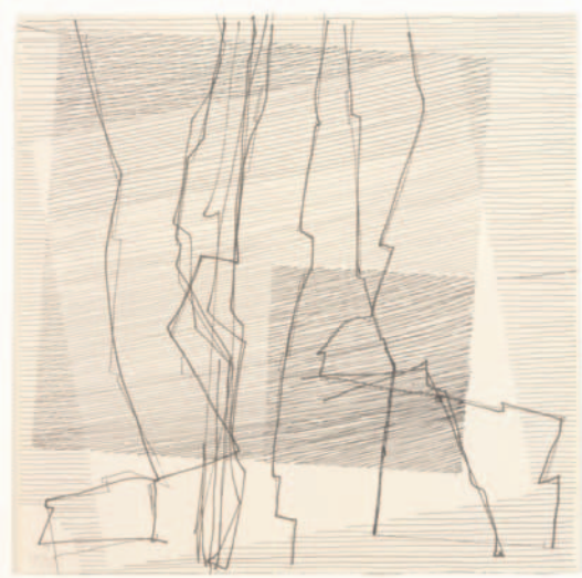
GEGO, Sin título [Untitled], 1963. Ink on cardboard, 11 3/16 x 11 3/16 inches. Fundación Gego Collection at the Museum of Fine Arts, Houston.