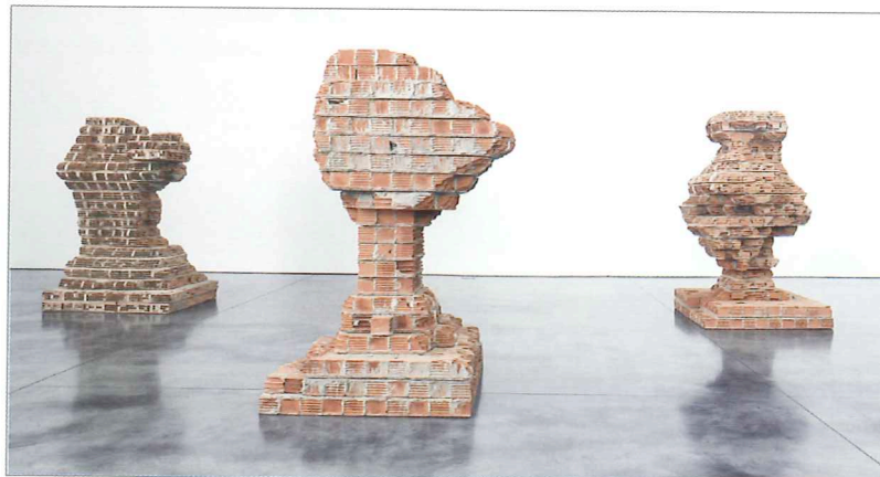
Damián Ortega. Capital Less , 2009.

The three-minute looped video is a rising shot of Ortega's own large composite photograph (to avoid the skewed perspective of a normal upward camera pan) of a building that one blogger called "edificio degradado," located near São Paulo's Mercado Municipal downtown. Officially titled "Edifício São Vito", the fifty-year old, immense, multi-