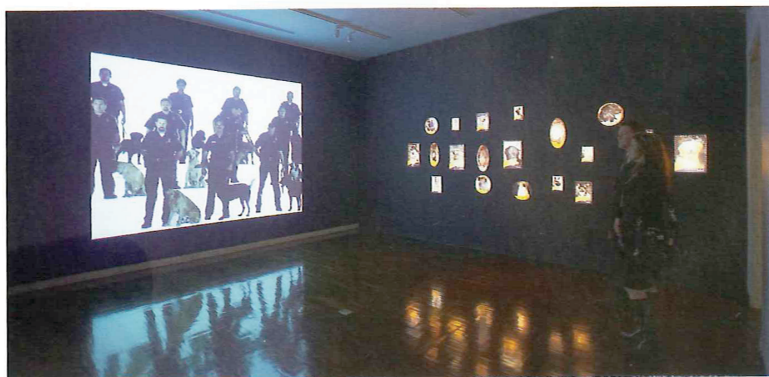
Dias & Riedweg. Installation view of the exhibition Dias & Riedweg...and it becomes something else , 2009.

In another installation, a large screen shows an action that unfolds on Park Avenue: a truck parked on the street, in front of the building where the exhibition takes place, contains another work entitled Throw . Lasting 39 minutes, it is the longest video in the exhibit. It was recorded in Helsinki and shows people being interviewed in a public place commonly used as a forum for individuals to express their opinions. There, Dias and Riedweg asked people to throw whatever they wanted at the camera, but within certain limitations. There is no doubt that videos or photographs can be invasive, despite all of the people who enjoy appearing in them. Our senses register this weighty combina-