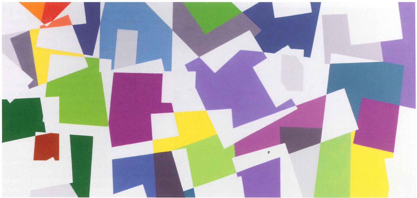
Untitled, Acrylic on Canvas, 2012

the paintings such that no single format designates which side is up conferring the feeling that several viable views are possible rather than a single dominant version of the reality of images.