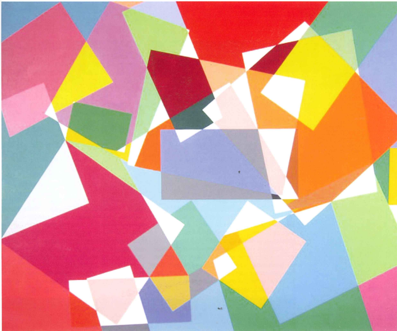
Untitled, Acrylic on Canvas