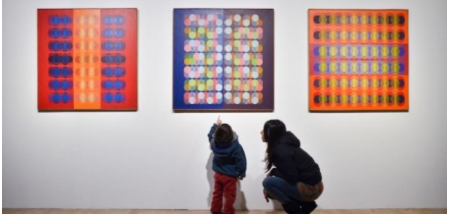
Geometry in Motion

'Geometría en Movimiento' ('Geometry in Motion') brings together over 40 pieces by renowned Argentine modern artist, Manuel Espinosa, examining the historical and conceptual theories behind abstract and illusionary art.