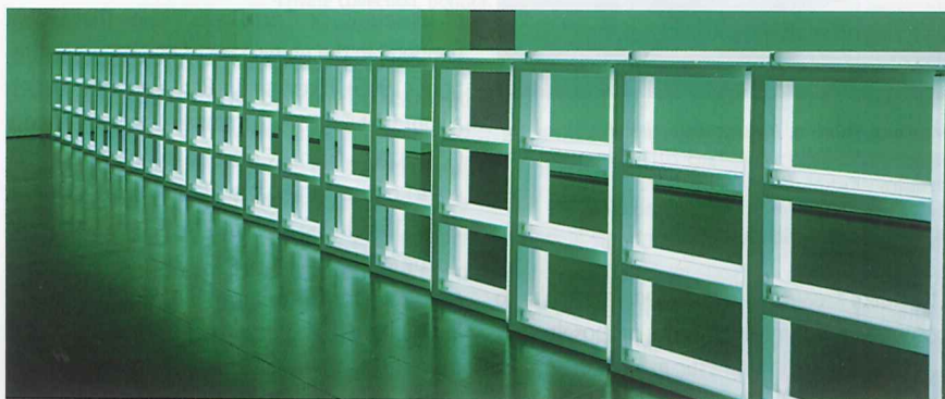
Dan Flavin. Untitled (To You Heiner With Admiration and Affection), 1973. Fluorescent tubes. New York, Dia Foundation.