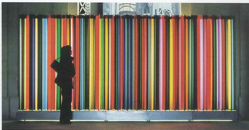
Carlos Cruz-Diez. Mechanic Transchromy , 1965. Plexiglass, aluminum, molding. Atelier Cruz-Diez. © Carlos Cruz-Diez. © Adagp, Paris, 2013.

Beginning with contemporary creators, Dynamo includes a large and varied number of artists who, with the technical advances and artistic languages of their generation, performed explorations centered on the subtlety of movement . Standing out among these works are the Circunconcentricos Transparentes (Transparent Circumconcentrics) by Elías Crespín, works that were delicately programmed and articulated with a computer; the uncertain depth of the immersive environments by Ann Veronica Janssens atomized with color; the impact of light flashes that Carsten Höller shoots like bullets ( Light Corner , 2001); the ultra-polished