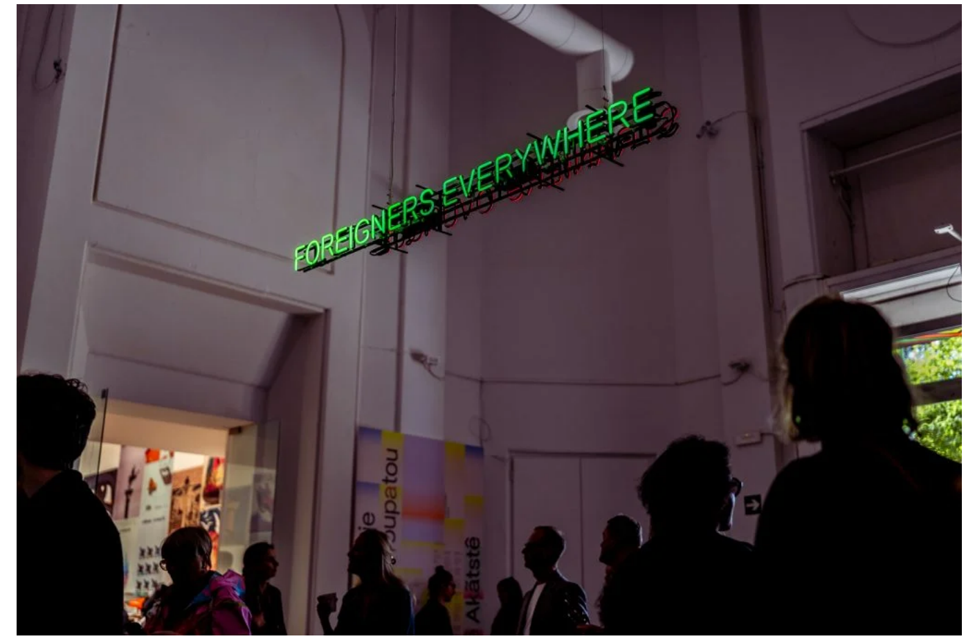
An interior view of the Giardini.

It is less interesting, to me, to know that this is the first time an artist was showing at the Biennale (as the wall labels indicated) than to actually be startled by the phenomenological encounter with a work. Painters like the Brazilian <u>Dalton Paula (https://jamesfuentes.com/artists/dalton-paula)</u> (the recipient of the 2024 <u>Chanel Next Prize</u> (<u>https://www.chanel.com/us/chanel-next-prize/2024/dalton-paula/</u>)</u>) and the Argentinian La Chola Poblete, both presented in the Arsenale, exhibited complex portraits of subjectivity incorporating objects and motifs of cultural memory. Paula uses portraiture to critically contest the hegemonic structures of what has been deemed "memory culture," or the socially constructed idea of what a community values as collectively held memories and forms the basis of their formation.