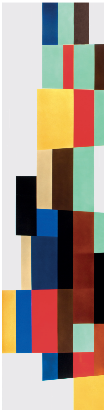
Tablón 31 , 1990 Industrial enamel on wood 78 11/16 × 21 5/8 in

Exhibition organized in collaboration with Otero Pardo Foundation