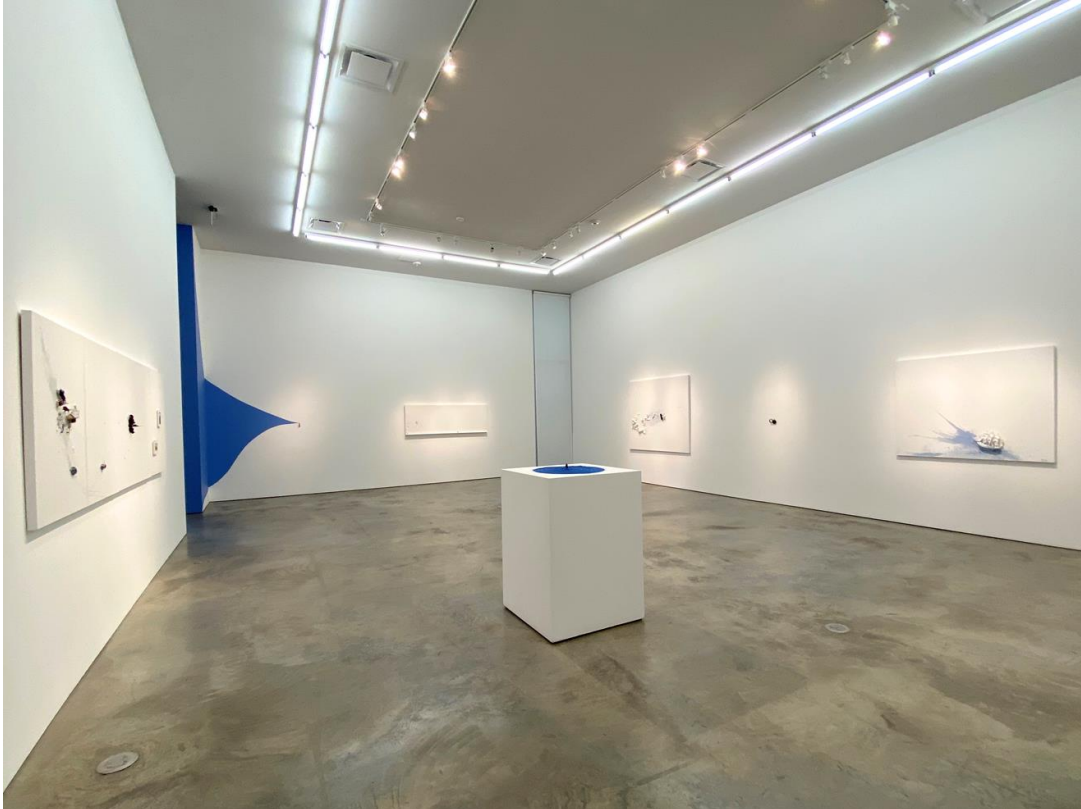
Installation view of Porter's 2020 "Red Brush and Other Situations" exhibition at Sicardi | Ayers | Bacino.

"The question of the meaning of time, is often present in my work. There is an attempt to make simultaneous dissimilar times: past, present and future may appear in an unexpected order. Real and virtual space could merge in the same point." - Liliana Porter