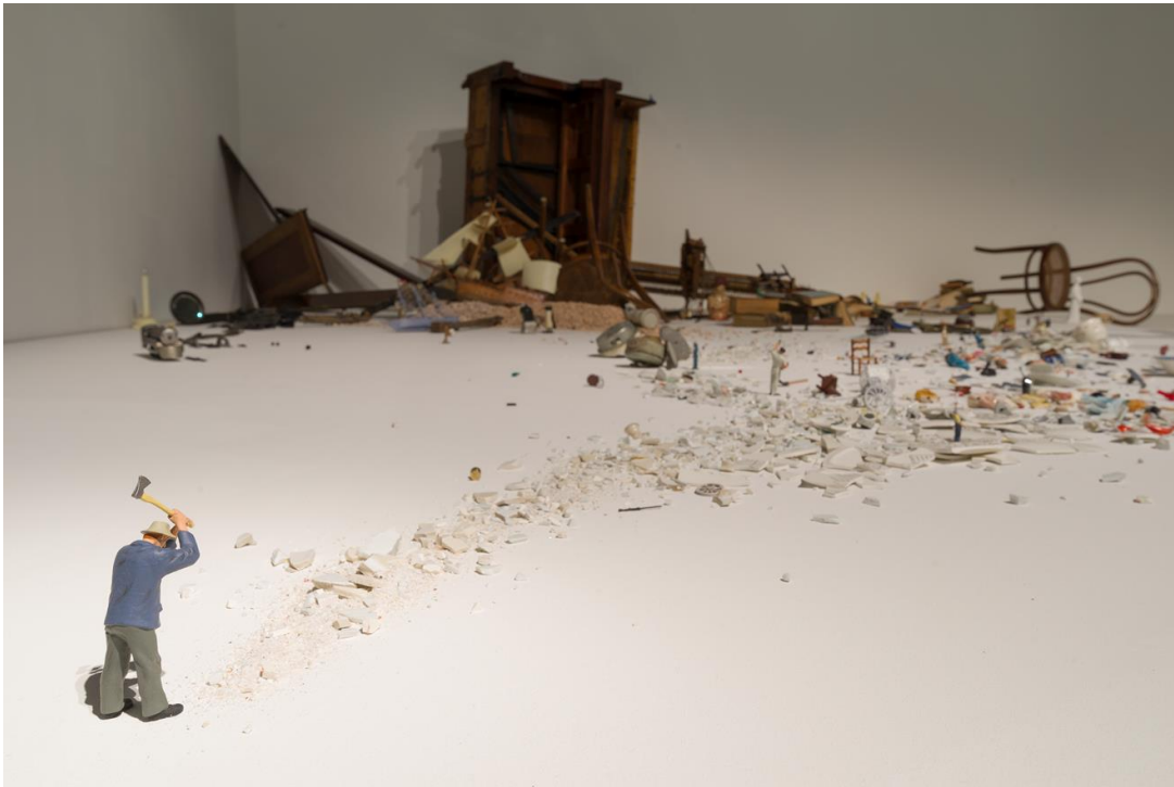
Man with Axe , 2017, is a site-specific installation created for the 57th Venice Biennale, and later acquired by the Pérez Art Museum Miami (PAMM).