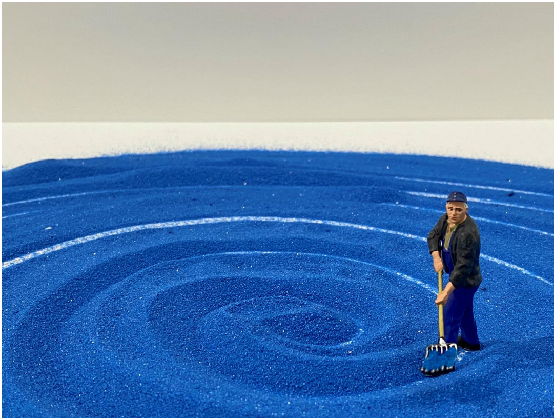
Liliana Porter, Blue Sand , 2018 (detail).

Sicardi Ayers Bacino 1506 W. Alabama St. Houston, Texas 77006 USA Tel +1 713.529.1313 info@sicardi.com