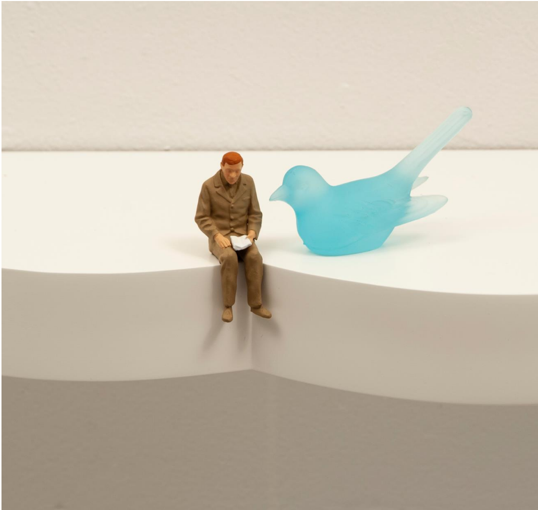
Liliana Porter, To Read, 2019. Glass bird and resin figurine on shelf, 43 x 10 1/2 x 4 in.

A native of Buenos Aires, Liliana Porter relocated to New York in 1964. In 1965, she co-founded the New York Graphic Workshop, which produced prints while redefining conventional models for making and distributing art. Porter's work often places carefully chosen small figurines and other objects in monochromatic empty backgrounds, addressing larger philosophical questions and emotional states. Alongside printmaking, she has also worked extensively in the media of photography and video, and has created works on canvas, drawings, collages, installations, and theatrical performances.