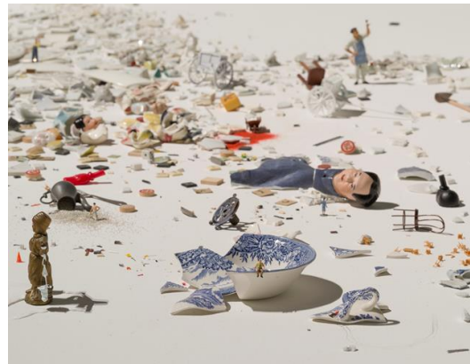
Man with Axe , 2017 (detail)