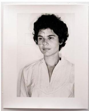
Liliana Porter. Self Portrait with Square II , 1973/2014.