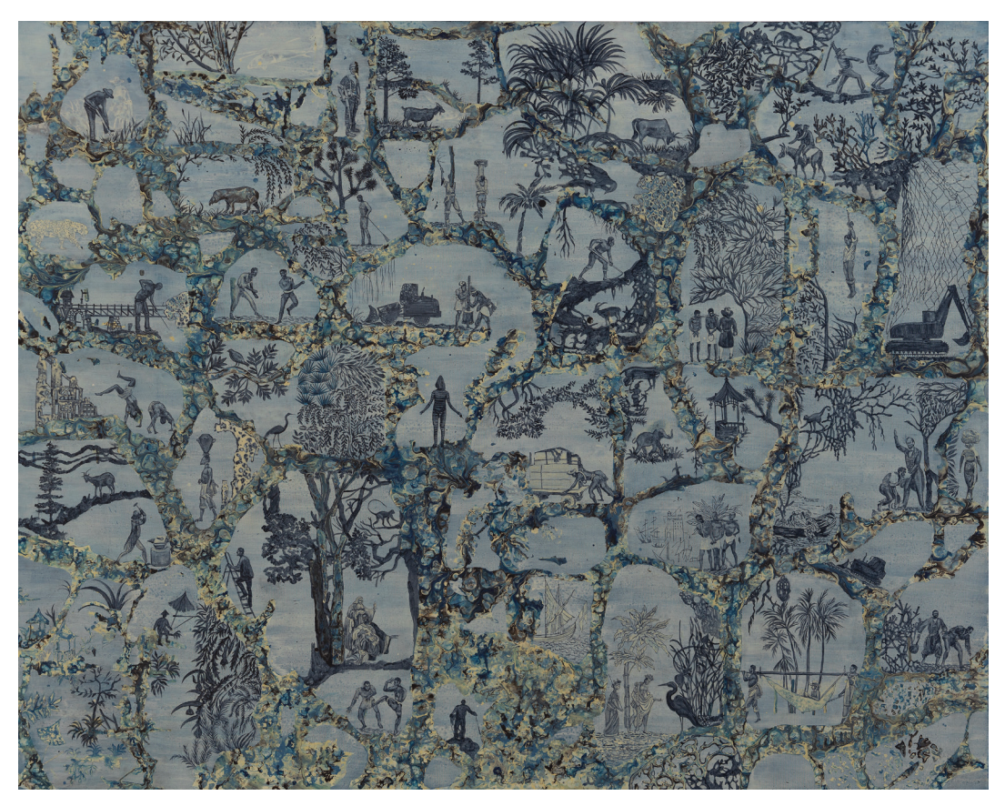
Rodrigo Facundo, Overgrown boundaries, 2023. Acrylic on canvas, 63 \times 78 3/4 in