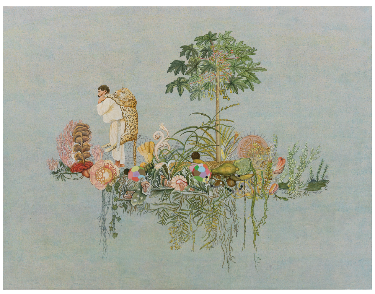
Rodrigo Facundo, Abatido, 2023. Acrylic on canvas, 25 9/16 \times 33 1/2 in