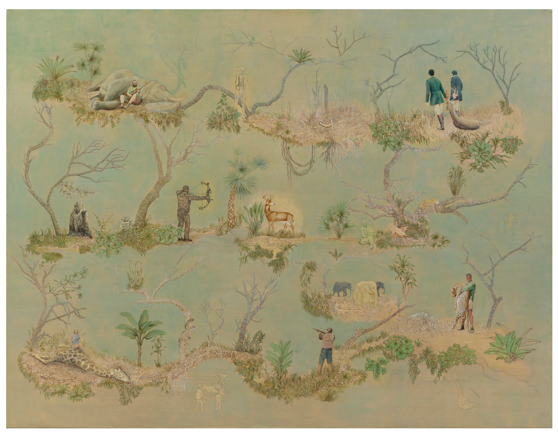
Rodrigo Facundo, Downhearted [Abatido], 2021. Acrylic on canvas, 62 3/4 \times 817/8 in